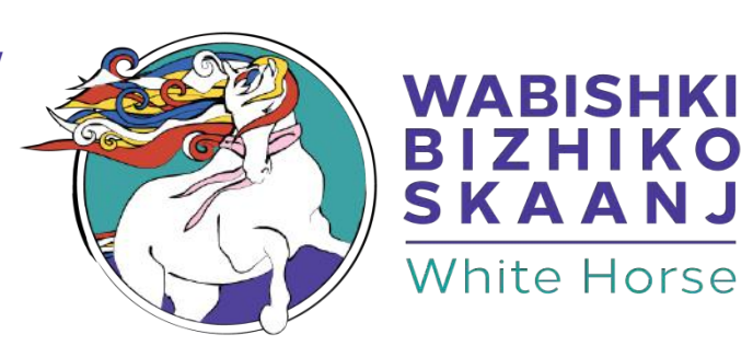
Fig. 2: Wabishki Bizhiko Skaanj Learning Pathway logo