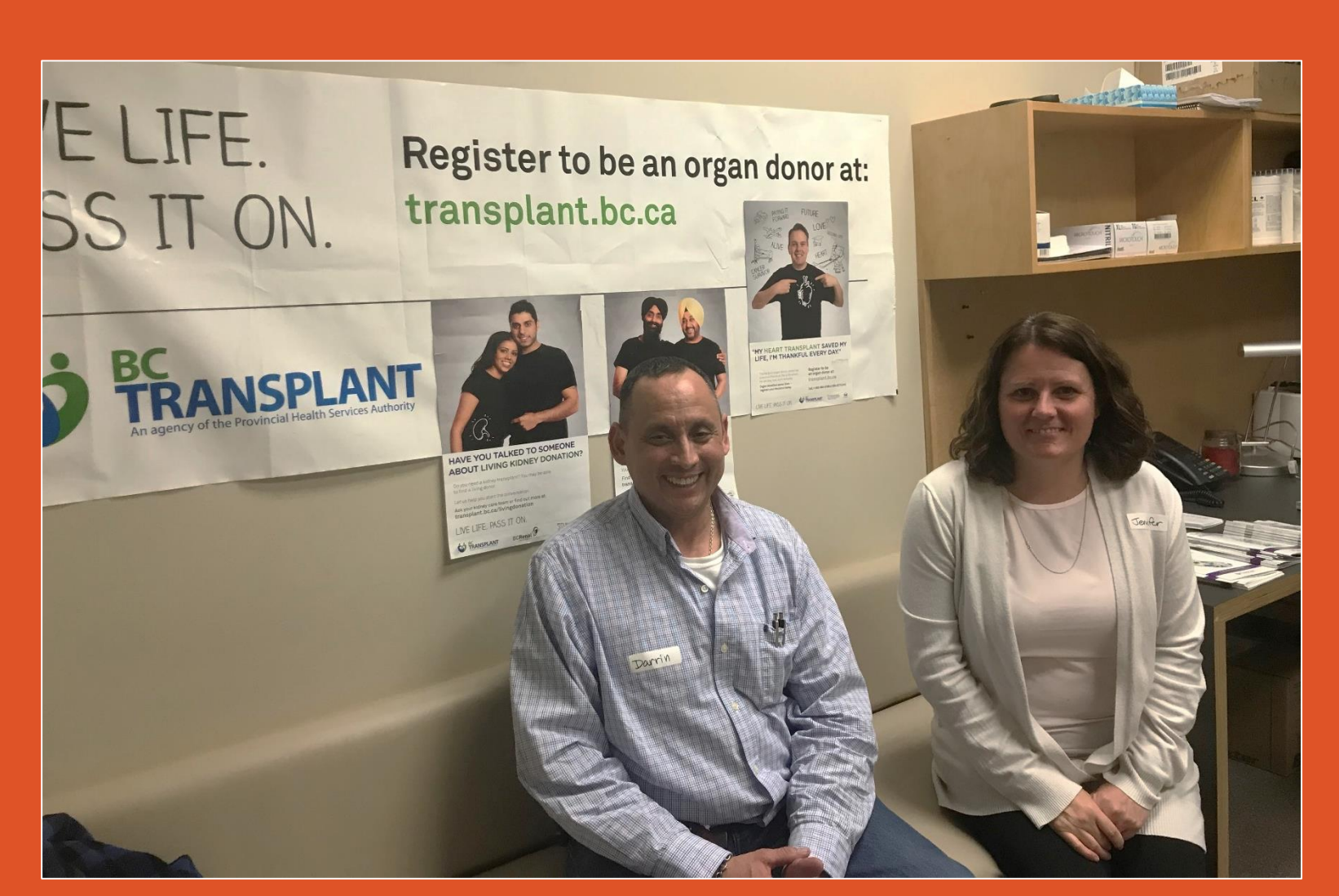
A Transplant Patient Participant with our Transplant Nurse

One or 2 Kidney Care Team members facilitated each station alongside the corresponding peer patient participant