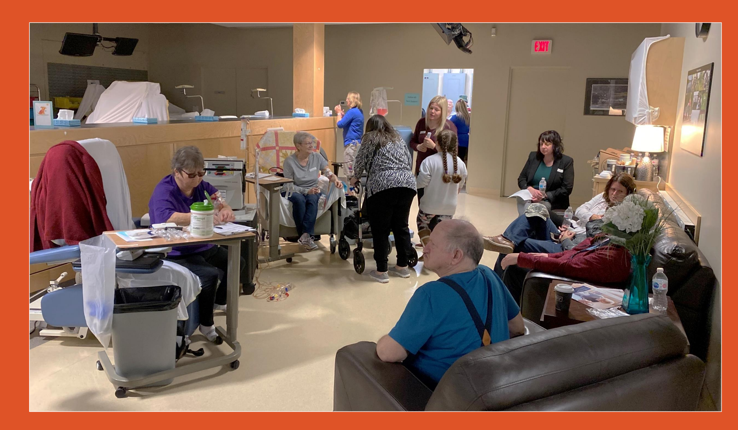
Home Hemodialysis and Independent Unit patient participants demonstrate the use of two dialysis machines available for home use

The small group numbers allowed for good discussion throughout all the stations Time was left after rotating through the stations for attendees to go back and ask questions or continue discussion on any of the covered topics