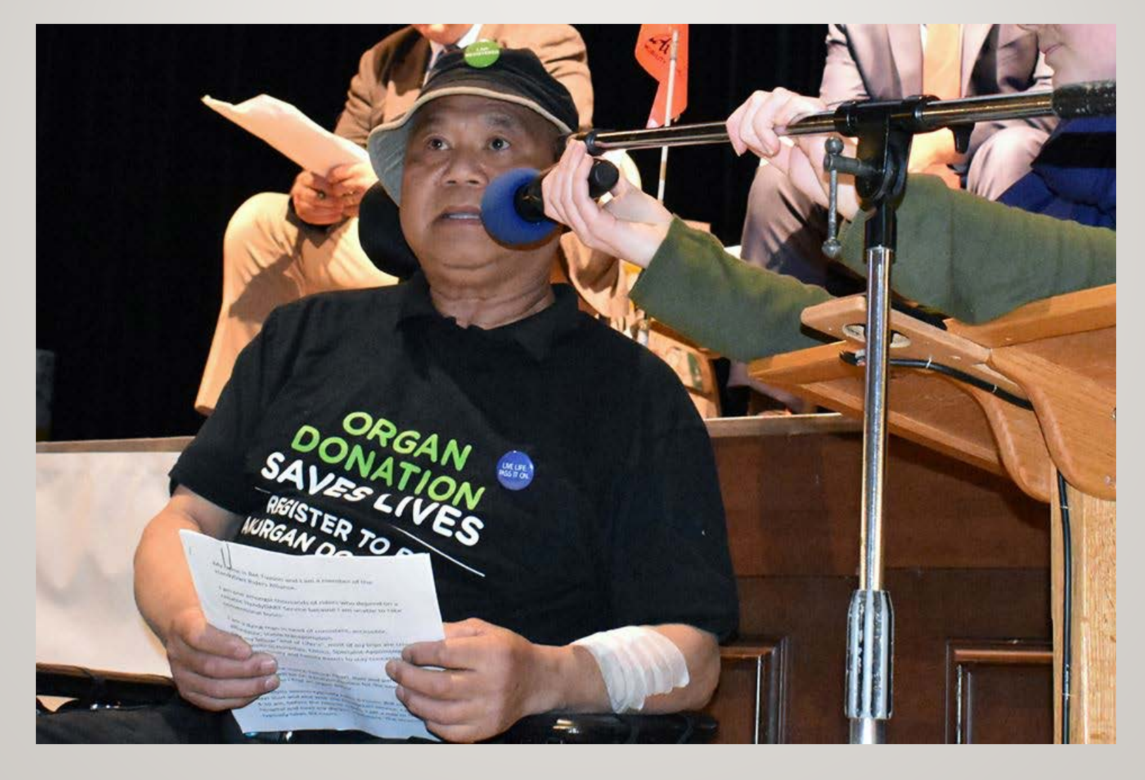
I advocate for people with disabilities and

I am a Board member of the HandyDART Advisory Committee